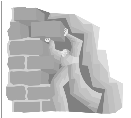
Roll Up Your Sleeves and Repair the Wall!