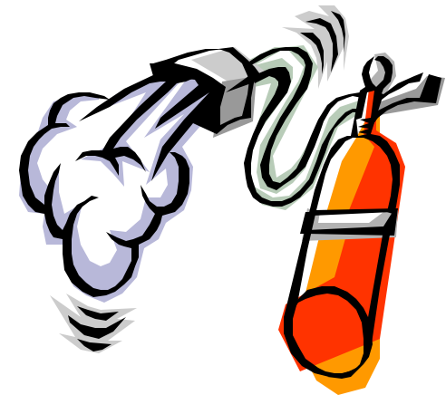
Keeping it handy — Just in case!

August afternoons can be fiery, so why not join AOFers for a bit of oratory to match? Members have a lot on their minds, but don't be afraid that the ambience in Room 10 at the Sierra 2 Community Center's will overload the air conditioning. We anticipate that the exercise of "sound thinking", along with the light buffet and beverages, will help us all keep our cool. Well, maybe. We can't guarantee you won't find fired-up presenters. It should be fun! Bring an item for the "salads-desserts" potluck .