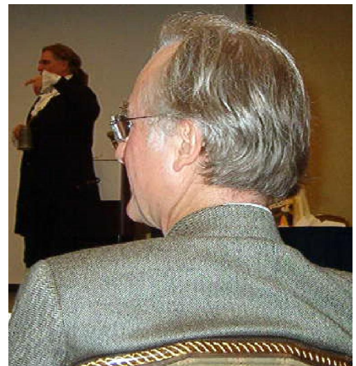
On Easter Sunday at the AAI convention, renowned atheist and evolutionary biologist Richard Dawkins chuckles at the presentation of a "resurrected" Thomas Jefferson.