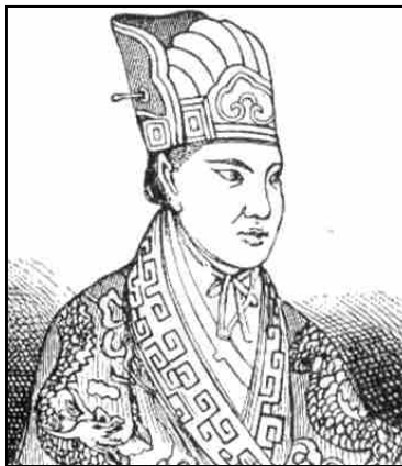
Hong Xiuquan, c. 1860, Leader of the Taiping Rebellion.

Centuries. Other tenets included gender equality, abolition of property, slavery, polygamy, concubinage, foot-binding, gambling, alcohol, opium and tobacco. Finally, and most importantly, Hong saw himself as the younger spiritual brother of Christ and Jesus. The new sect, at first consisting mostly of Hong and Feng family members, called itself The God Worshippers .