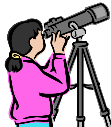
Peering into AOF's future—stay tuned to hear more about what's happening in the years ahead!

AOF board members plan to hold a strategic planning retreat in June. The board deemed the retreat necessary to address issues normal board meetings cannot address in depth, such as: financial stability, including budgeting; issue advocacy; educational development; fundraising; Internet presence; media relations; public events; local group benchmarks; organizational issues; building community; marketing and group growth; and five-year strategic goals. An ambitious list! If you want to help support this project in any way, please contact the AOF board by e-mail or voice-mail (see page two for details).