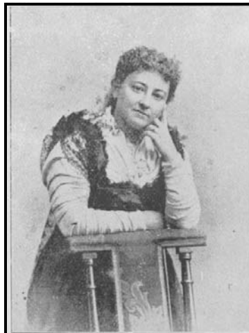
Olive Schreiner (1855-1920) South African author, pacifist, and political activist.

"Yes," said Undine , getting off the box, with a face alternately as red as