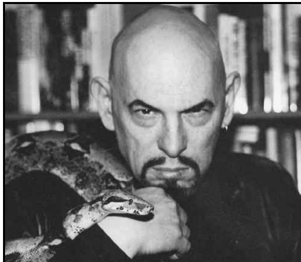
"Let us be honest .... There is no God ... no deity who gives a damn about the fortunes of man. There is no Heaven, there is no Hell, except here on Earth. There is only one redeemer: Your own mind, body, and spirit. The Satanic Age is upon us. Admit it, take advantage of it and LIVE, which is evil spelled backwards. " —Anton LaVey (1930-1997)

Another tale: His wife gave him a bad haircut for the event. So he shaved his head, liked the look, and kept it.