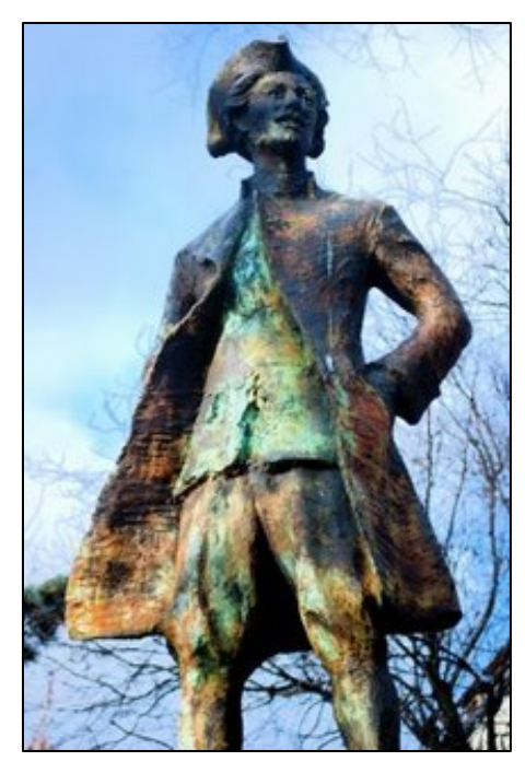
A statue of Jean-François Lefevre in France.

This was more serious. According to Voltaire, civil and church authorities were now sure they had found the vandal. La Barre pleaded for