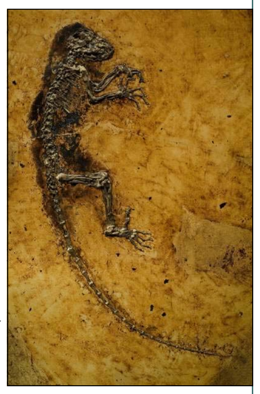
Main slab of the Darwinius masillae holotype fossil (specimen PMO 214.214)

Life stage . Ida is a young juvenile, estimate to be right on the transition from requiring parental care to independent living. That means she has a mix of baby teeth and adult teeth — she's a two-fer, giving us information about both.