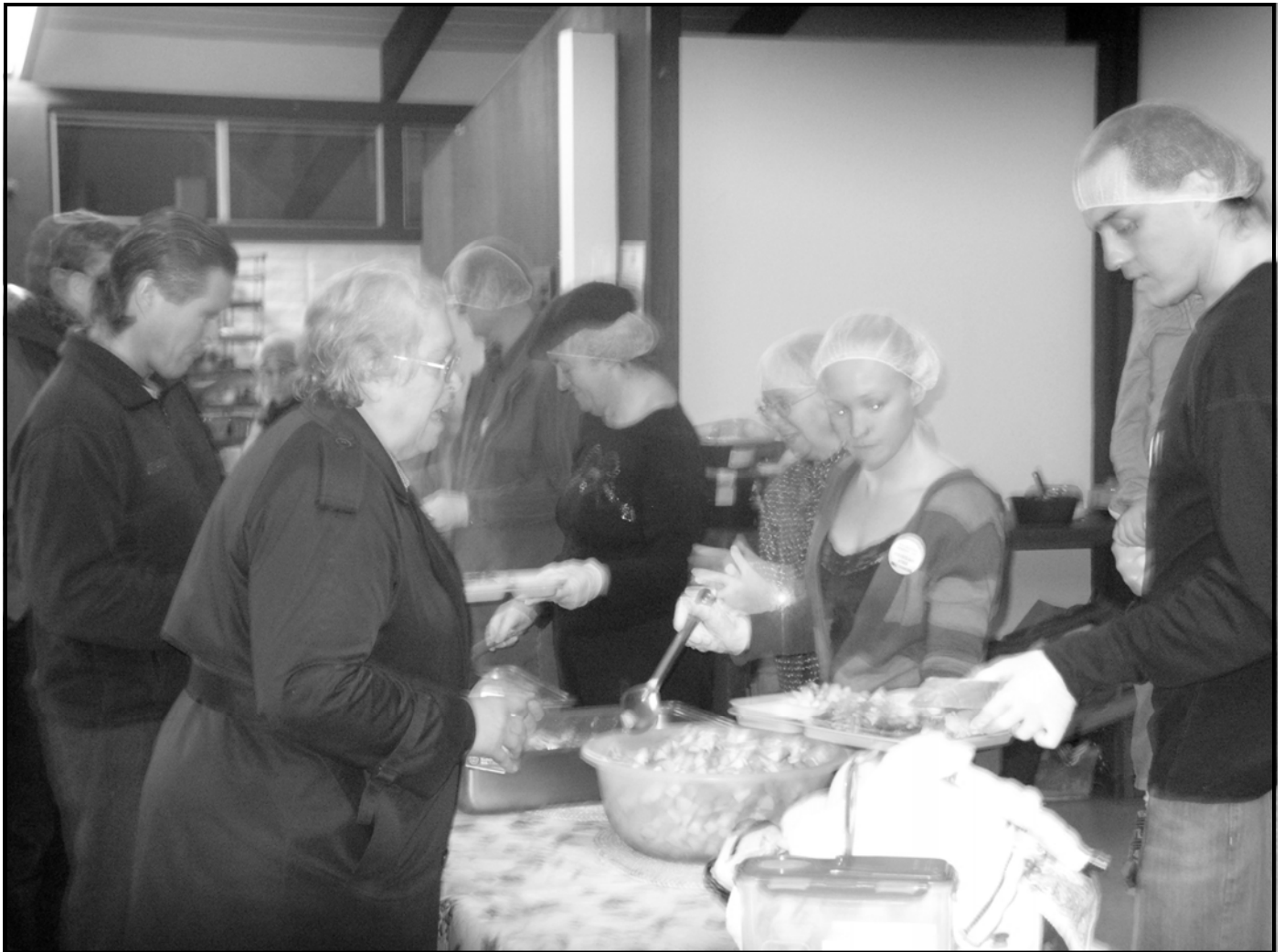
AOF members serve gatherers at the November 30 Davis Community Meals event at St. Martin's Church in Davis