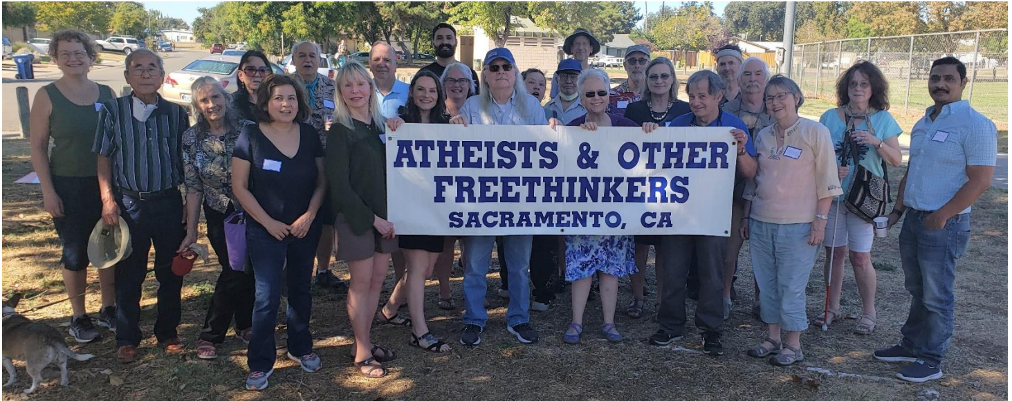
Well-fed AOF folk at the annual Picnic in the Park (Sep 25). We were there – where were you?