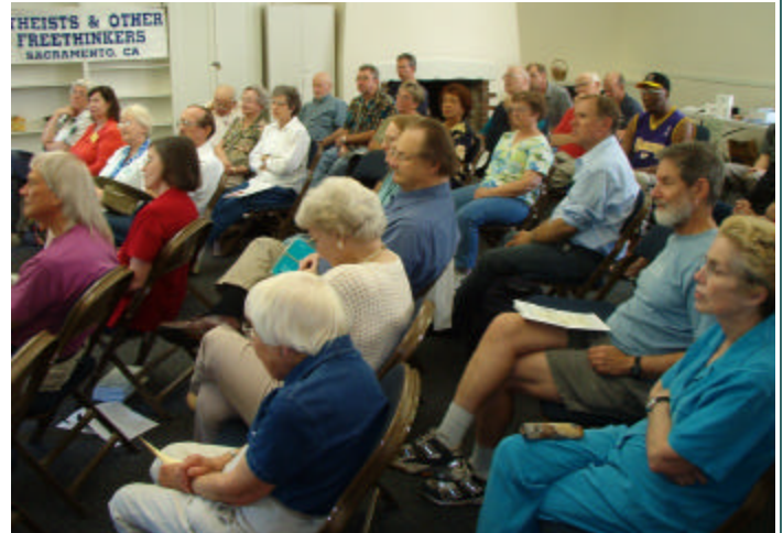
Fifty-five were in attendance at a planned "civil discussion" between persons who hold some profoundly different worldviews..