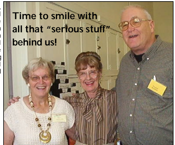
Time to smile with all that "serious stuff" behind us!