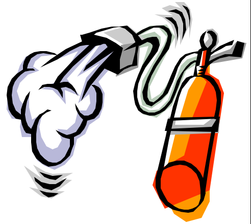
Keeping it handy — Just in case!

August afternoons can be fiery, so why not join AOFers for a bit of oratory to match? Members have a lot on their minds, but don't be afraid that the ambience in Room 10 at the Sierra 2 Community Center's will overload the air conditioning. We anticipate that the exercise of "sound thinking", along with the light buffet and beverages, will help us all keep our cool. Well, maybe. We can't guarantee you won't find fired-up presenters. It should be fun! Bring an item for the "salads-desserts" potluck.