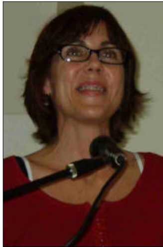
Happy with a victory, at long last!