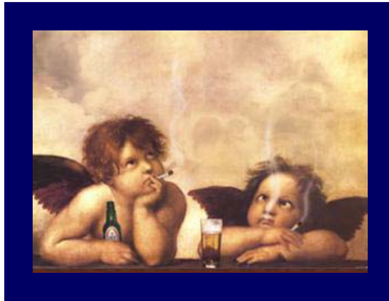
Two Other Fallen Angels

of confusing faith with dogma, or using faith to justify greed, war, racism or homophobia. And the end, involving a Biblical-scaled holocaust of flying body parts, with the answer to the One Cosmic Question you always wanted to ask God, is pure popcorn.