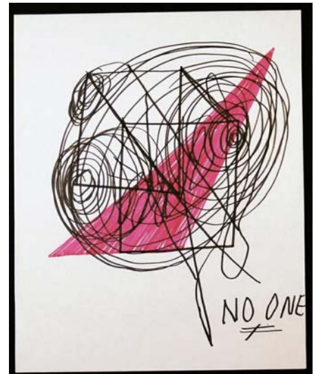
"Mystery Puzzle"

Matt is currently working on a paper on faith. (Continued on page 4)