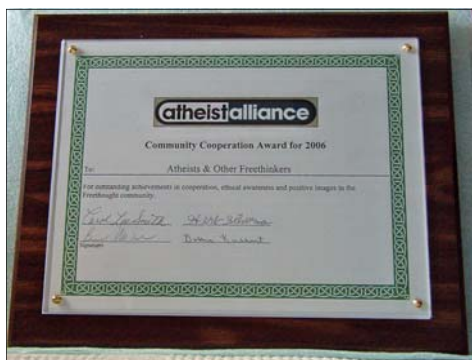
Community Cooperation Award Plaque

This annual award of $500 is given to a Freethought organization that demonstrates a positive image, ethical behavior, and cooperation with its larger community.