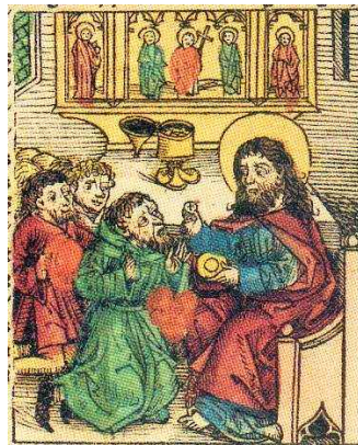
Prester John, from Hartmann Schedel's Nuremberg Chronicle, 1493

Other expeditions followed, hoping to reach and rescue the Prester’s kingdom, and maybe skim a small profit from his magic seeing-mirror, the rivers of gold or the Fountain of Youth (the letter was the first recorded mention of such a fountain). One problem: no one knew where the Three Indias were—like Cathay (China) and Ultima Thule, India was more of a metaphor than for “someplace far.” One envoy after another came limping home, or van-