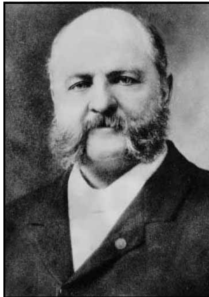
Anthony Comstock, "anti-obscenity crusader."

nett, founder of the Truth Seeker Society, the oldest freethought organization still extant. Bennett's crime was to publish a scientific tract (written by a former minister) on marsupial reproduction, and to publish his essay, "An Open Letter to Jesus Christ." Later Comstock entrapped Bennett for mailing a free-love pamphlet. The notorious trial became a cause célèbre , and Bennett spent 13 months at hard labor in Albany Penitentiary.