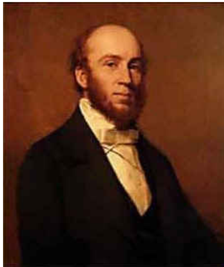
Charles Piazzi Smyth (1819-1900)

In the smoky halls of pseudoarcheology, the pyramids nearly rival Atlantis. A common idea is that pyramidal dimensions are occultly significant, or hide an encoded message. Dividing them, John Taylor found that the numbers pi and phi (the Golden Ratio, \approx 1.61803 ) turned up far too often for coincidence (he didn't think how centuries of erosion had altered those dimensions). Not to be outdone, Charles Smyth teased complex meaning from the number of stones lining the Great