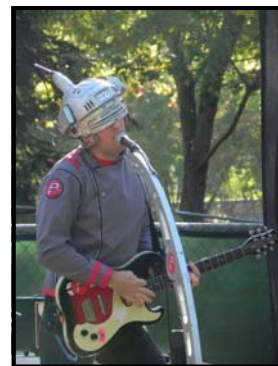
Musical entertainment by the Phenomenauts