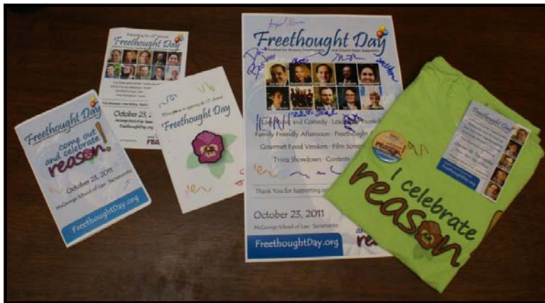
FTD 2011 materials.