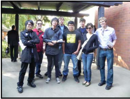
Students traveled all the way from UC-Merced