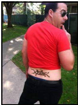
The Flying Spaghetti Monster in an unusual spot