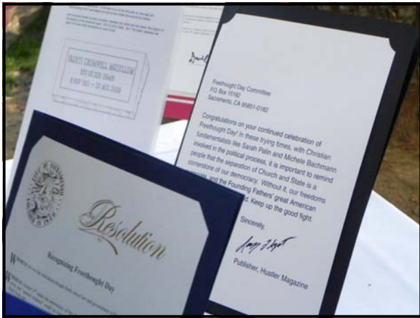
Resolutions and recognitions on display