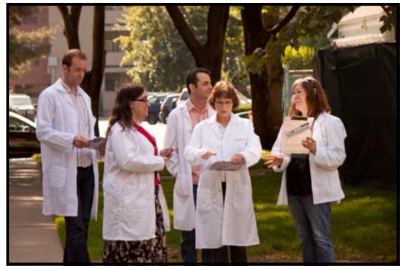
The Mockingbirds prepare to sing on stage