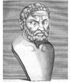
(The real Thales had arms)

The Birthday of Science marks the day Thales of Miletus (in 585 BCE) correctly predicted a solar eclipse. A better choice might be the discovery of fire or the wheel, but we don't know exactly when that happened or who did it. We do know about Thales. His prediction was significant because the idea of cause and effect (causality) applies to all science. Given any phenomenon, with the exception of purely random quantum events, in principle we can trace its cause or causes, and the cause of those causes, back through time -- until all cause-tracks merge at the "Big Bang," beyond which, presumably, no tracks remain. The seeds of our life and future were sewn then. The Large Hadron Collider is an effort to re-create those first moments.