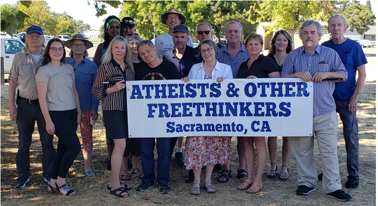
Happy & well-fed AOF friends & guests at the Sept 29 picnic. If you missed it, we missed you [insert sad face].