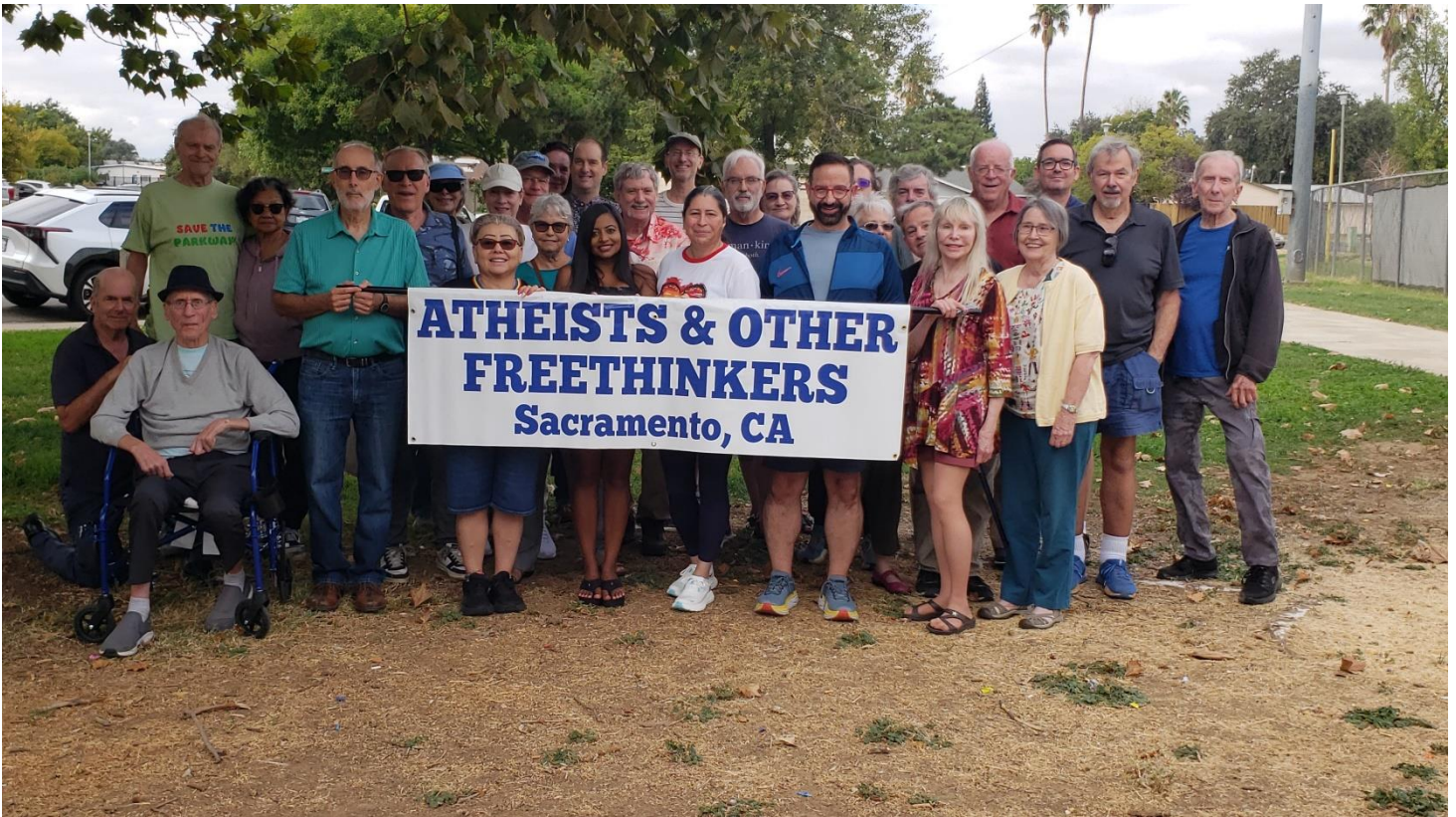
Freethinker Picnic at Westwood Park, Sept 28, 2025

AOF News & Views – Newsletter for October 2025