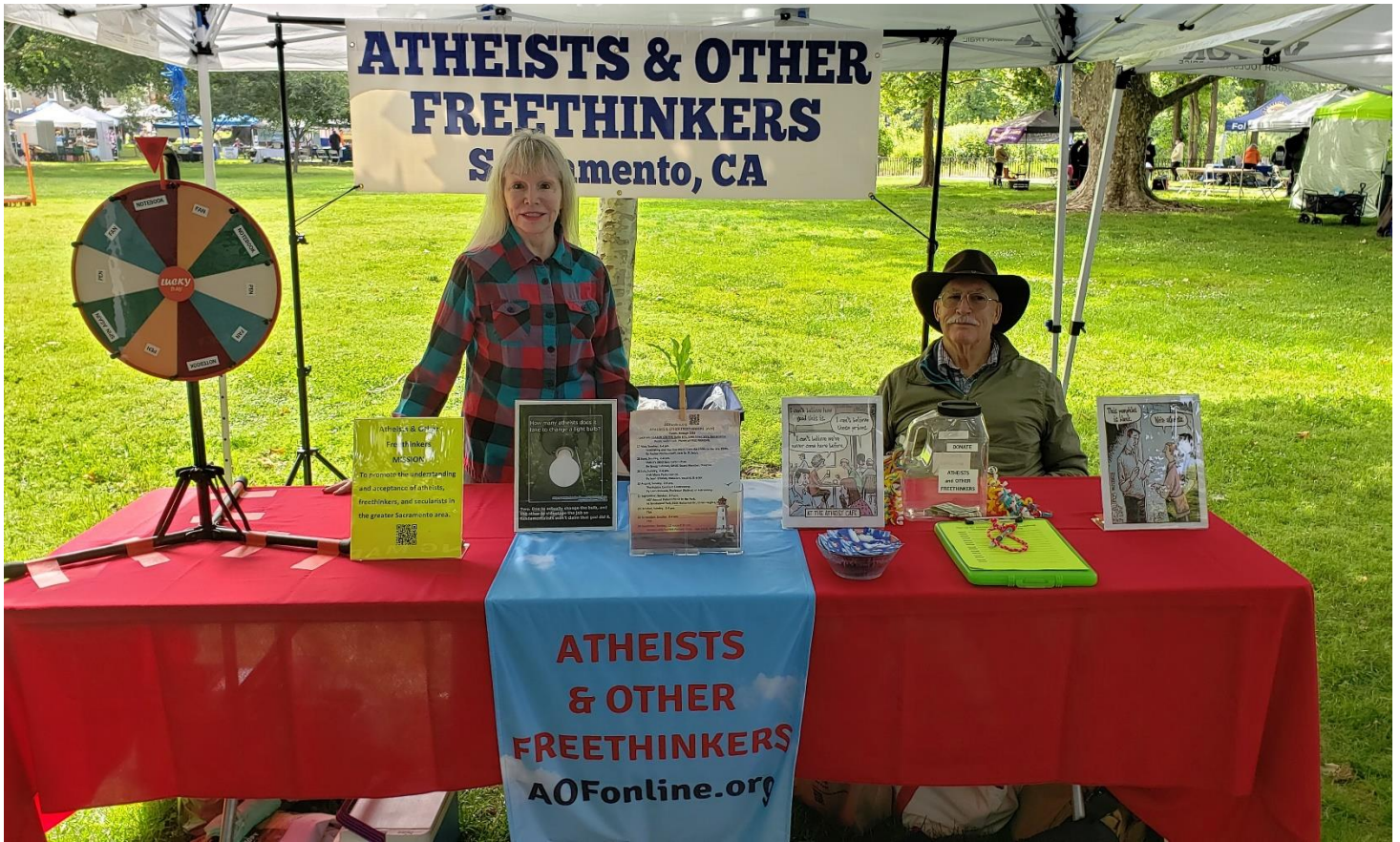
AOF at Sacramento Earth Day, April 26, 2026